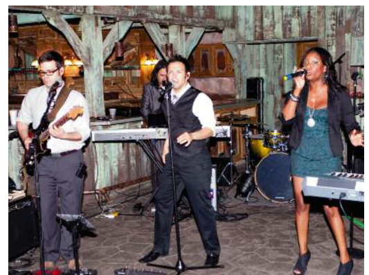
Bell Helicopter-Textron sponsored the Opening Reception at Mardi Gras World with live music and cajun food.