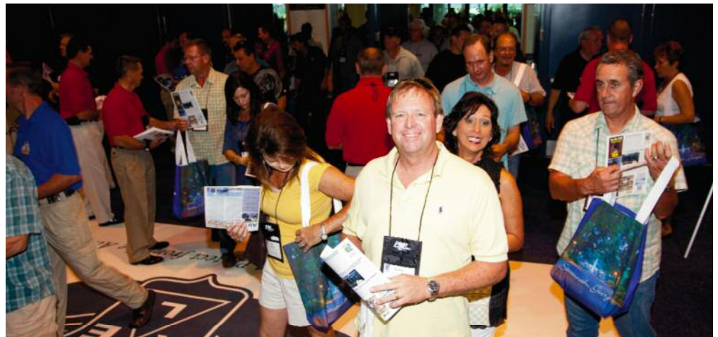
Exhibitors welcomed ALEA members to preview the latest products and services for public safety aviation.