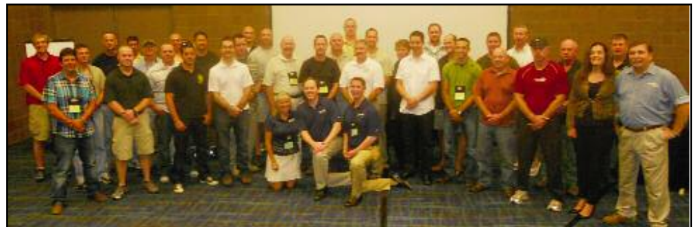
ALEA's Airborne Thermographer/Advanced Thermal Imagery & Tactics Course, sponsored by FLIR Systems, concluded yesterday. Above is the first graduating class of certified thermographers.

Did you know that ALEA has started two social networking groups? Join your other ALEA friends and network here!